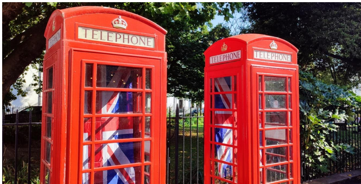
Language courses in Eastbourne

All language courses are for the duration of two weeks. It is possible to study English or German at language schools in Great Britain, Malta or Germany.