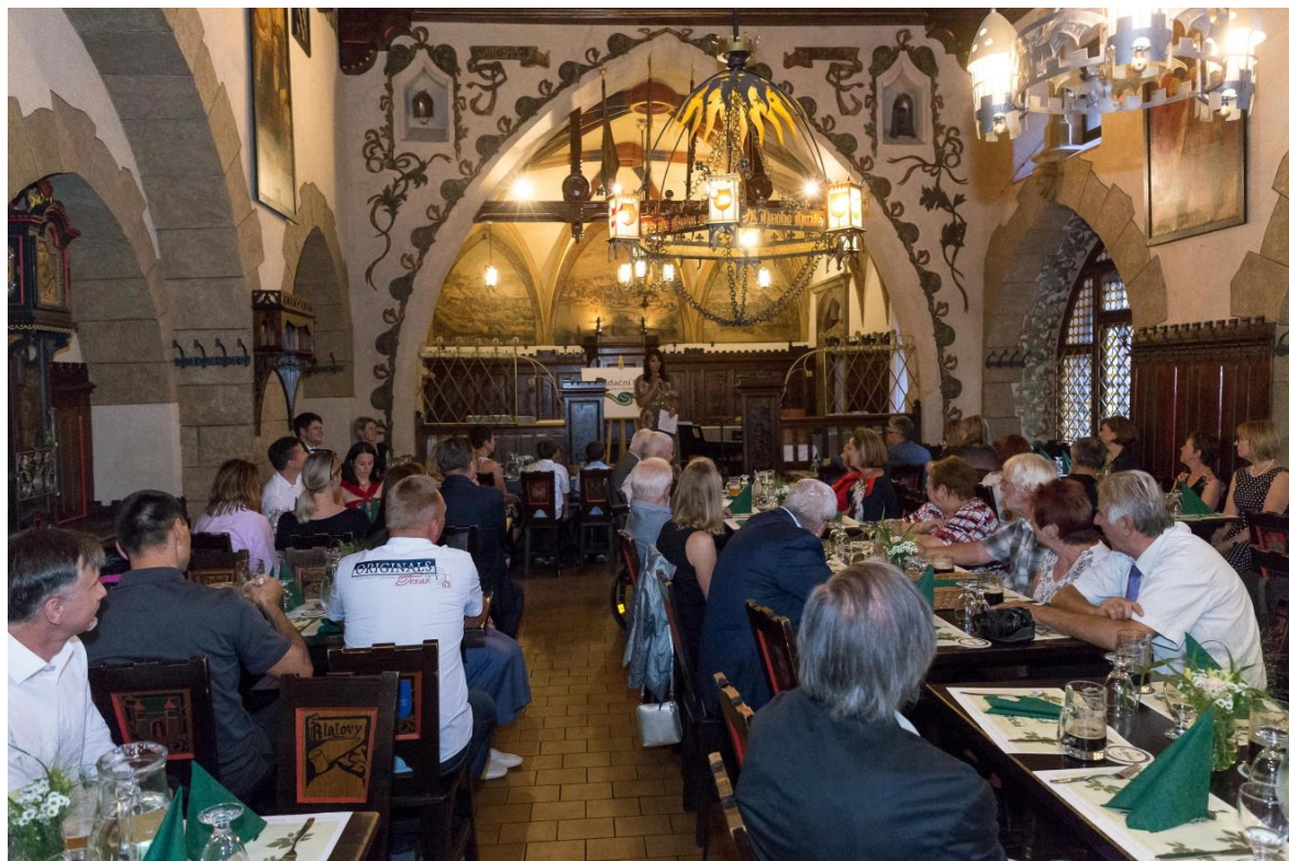
Meeting of NF supporters - Knights' Hall, U Fleků restaurant - June 2022