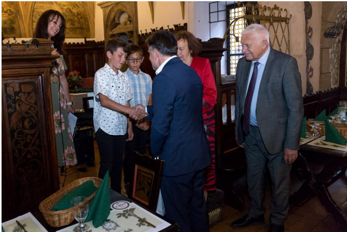
Handing over a laptop at a foundation fund meeting