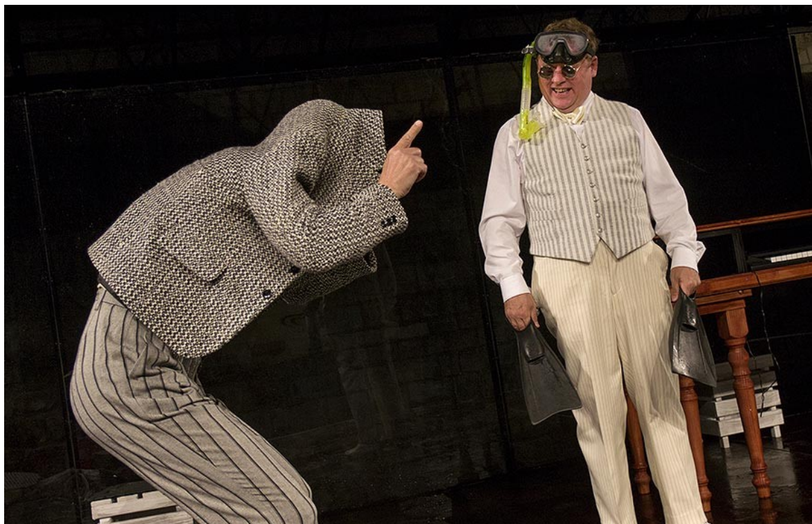
The Twelfth Night

Like every year, the tickets were offered to donors, volunteers and well-wishers of the Fund to express our thanks for their support, faithfulness and trust. We also presented the tickets to several seniors chosen in a raffle who had successfully completed a course in computer use which was scheduled in the framework of our “Seniors Communicate” project and who participated in the meeting of donors. We tried to enable all our recipients to take delight in an unforgettable summer evening, while watching one of Shakespeare’s plays in the Supreme Burgraviate of Prague Castle or in the Lichtenstein Palace – HAMU – on Malostranské Square.