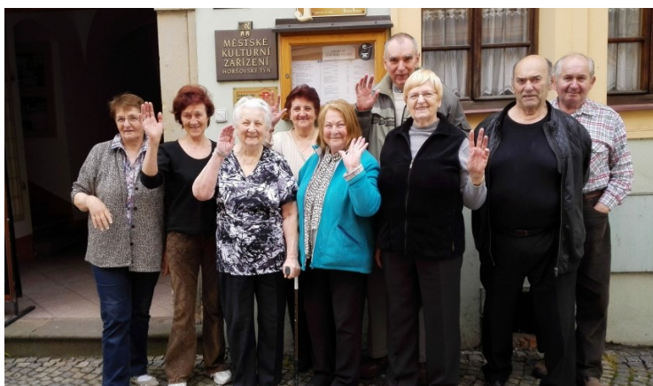
Senior citizens from Horšovský Týn

The project fulfils an educational purpose as well as having communication and socializing aspects, as the name of the project itself suggests. Seniors are offered a reason to leave their homes and meet their peers in a totally different environment and confront issues beyond the scope of their everyday life. The acquired knowledge enables them to endeavour further in communication for either