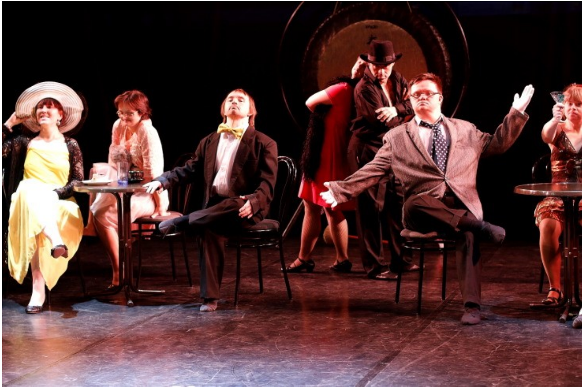
Studio Oáza – a dance show Roxie’s Bar

In 2016, the Fund supported 5 applicants for “cases of special reference“, out of whom there was one legal entity. We made our contributions to cover a curative stay, a music camp and study related expenses.