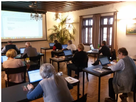
Seniors communicate – a course in Rudolfovo

In 2015, 96 courses took place in as many towns and villages. The implementation of the project employed 12 organisers and total costs amounted to CZK 1,055,136 including the production of new teaching texts. These texts are extraordinarily highly valued by the participants as well as the professional trainers.